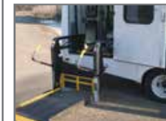
Rear Wheel Chair Lift