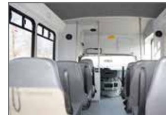
Stylish Coving with Integrated Dome Lights