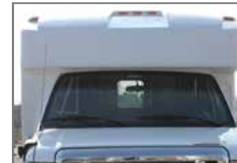
Recessed LED Clearance & Marker Lights