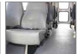
Spray-on Textured Flooring