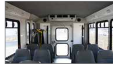
Spacious Interior Design

Due to constant product improvements; specifications, component parts and optional equipment are subject to change without notice or obligation. See your dealer for details. Photos may show optional equipment.