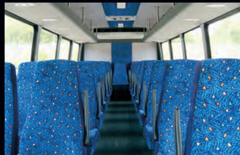
Optional 19" wide high back seats, armrests, and cloth upholstery offer a comfortable ride for all passengers