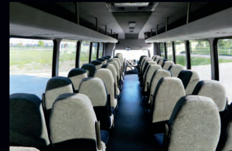
Large panoramic solid windows offer the best view for every passenger