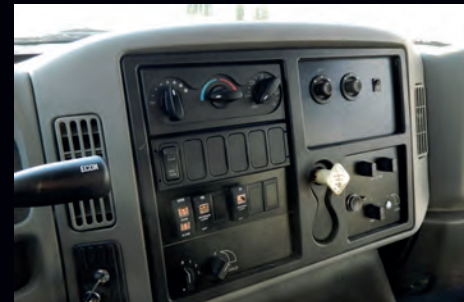
Driver's switch panel conveniently located within driver's view of the road