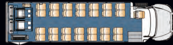
28 Passenger Plus 2 Wheelchair Positions Plus 2-Passenger Foldaway and Two 2-Passenger Flipseats