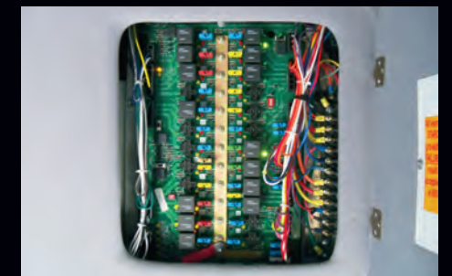
Printed electrical circuit board with LED trouble-shooting lights