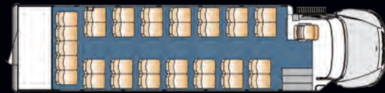
33 Passenger Plus Rear Luggage