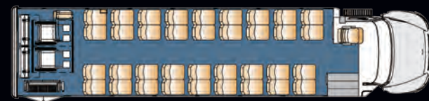
36 Passenger Plus 2 Wheelchair Positions Plus 2-Passenger Foldaway and Two 2-Passenger Flipseats