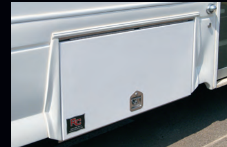
Optional skirt mounted storage pod for storage of beverages, snacks, or the sport teams extra gear