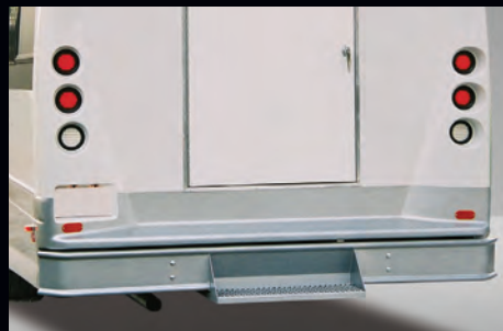
Standard fiberglass rear cap and steel rear bumper with rear step for ease of loading luggage into luggage area