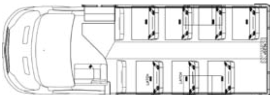
TL400 - 14 Passenger (Non CDL)