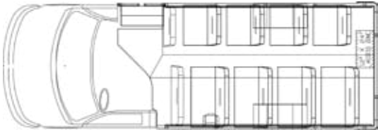
SL400 - 20 Passenger