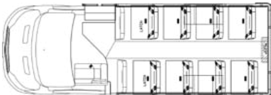
TL400 - 16 Passenger